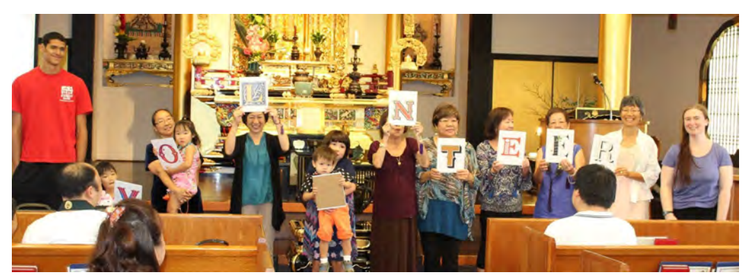
Volunteer Appreciation Service on April 26