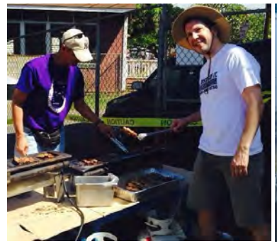
March Madness held on March 1