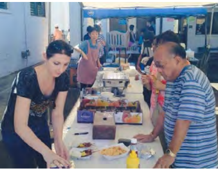
March Madness food booth, chili, spam musubi, and yakitori plate.