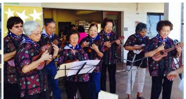
Happy Strummers performing at March Madness