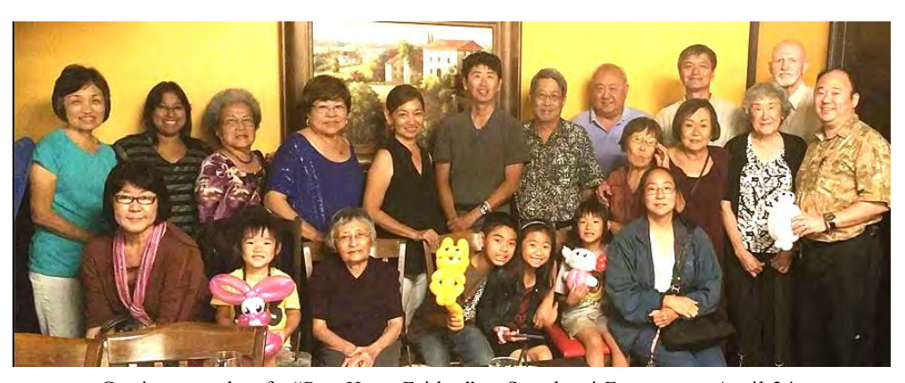
Getting together for "Pau Hana Friday" at Spaghetti Factory on April 24