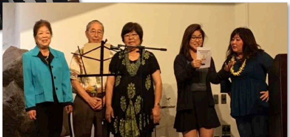
Koko Ni Sachi Ari, "There is Happiness Here"