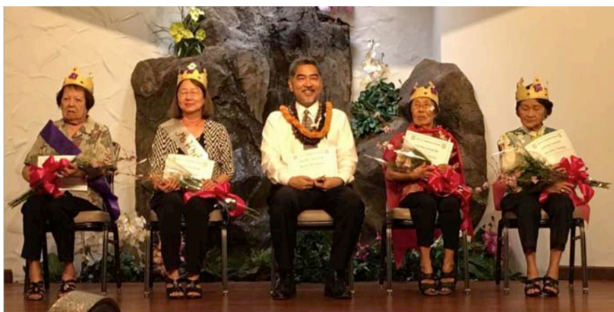
Moiliili Hongwanji 2017 Living Legends