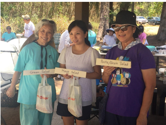
The White Way, Vol. 61 – No. 8