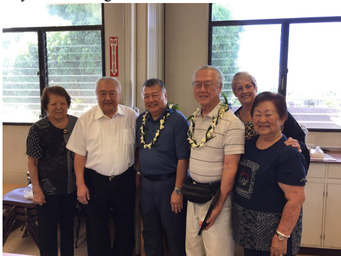
at Hilo Betsuin.