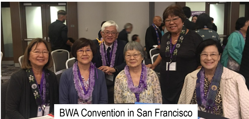
BWA Convention in San Francisco