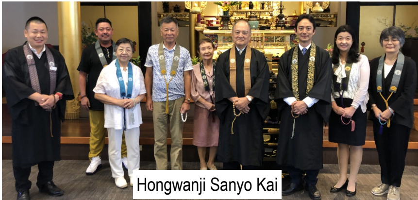
Hongwanji Sanyo Kai