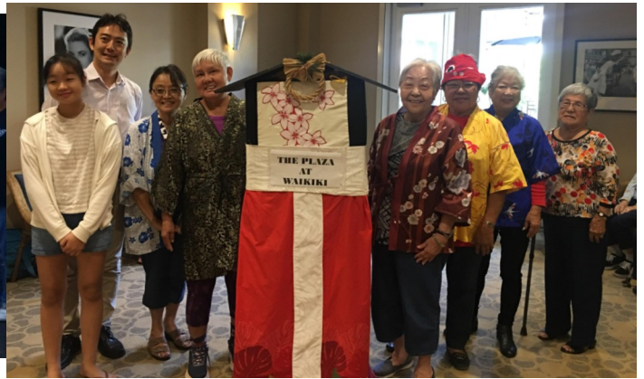
Plaza Bon Dance