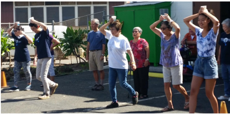
Temple Fun Day