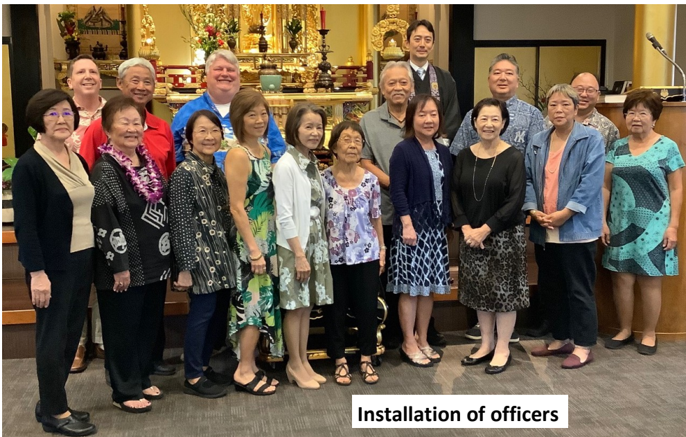
Installation of officers