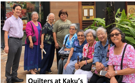
Quilters at Kaku's