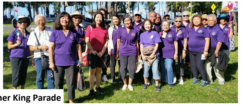
Martin Luther King Parade