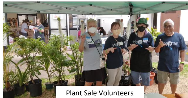
Plant Sale Volunteers