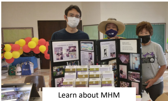
Learn about MHM