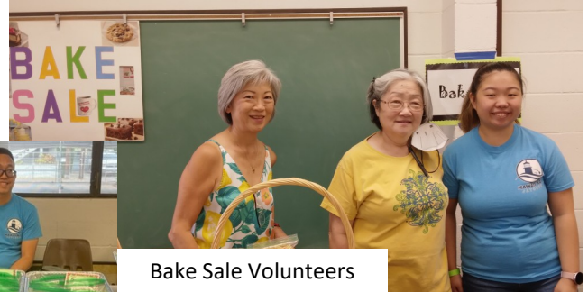
Bake Sale Volunteers