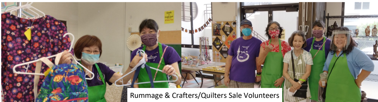
Rummage & Crafters/Quilters Sale Volunteers