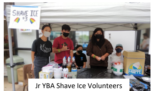
Jr YBA Shave Ice Volunteers