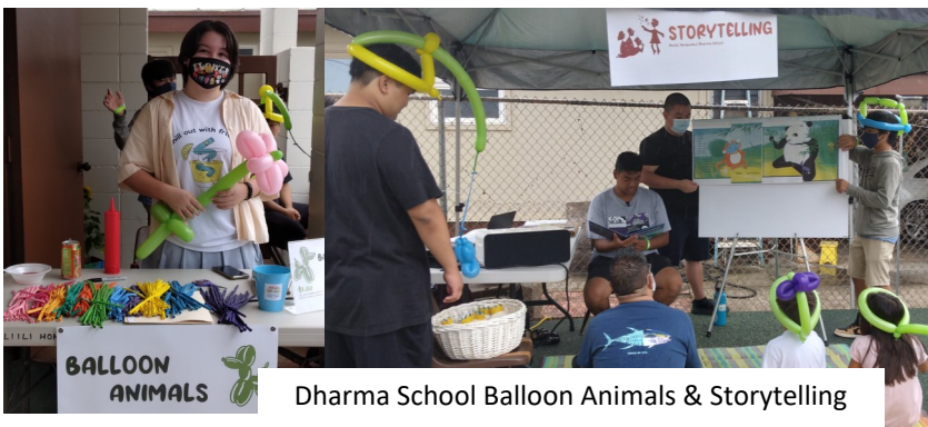
Dharma School Balloon Animals & Storytelling