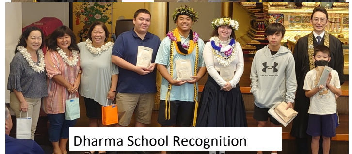
Dharma School Recognition