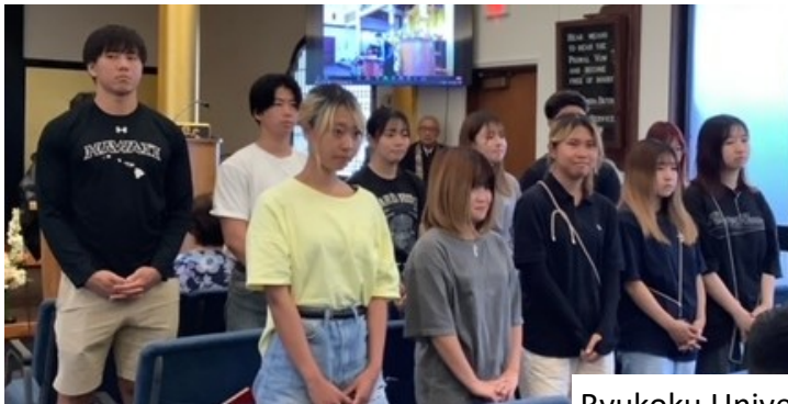
Ryukoku University Students