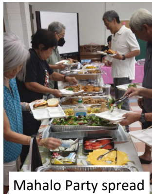
Mahalo Party spread