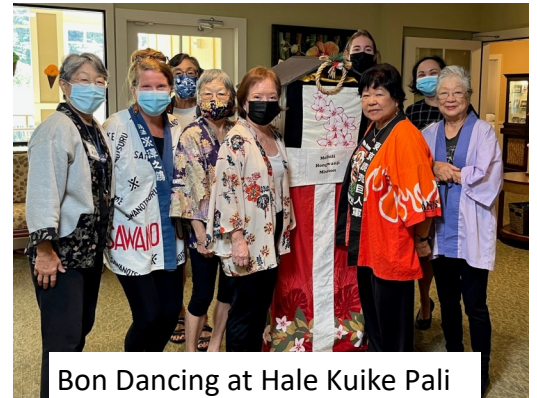
Bon Dancing at Hale Kuike Pali