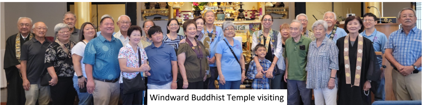
Windward Buddhist Temple visiting