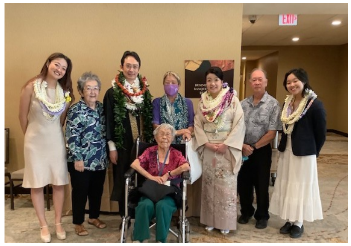
Umitani Family at Welcome Banquet