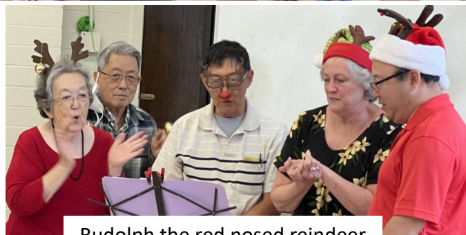
Rudolph the red nosed reindeer