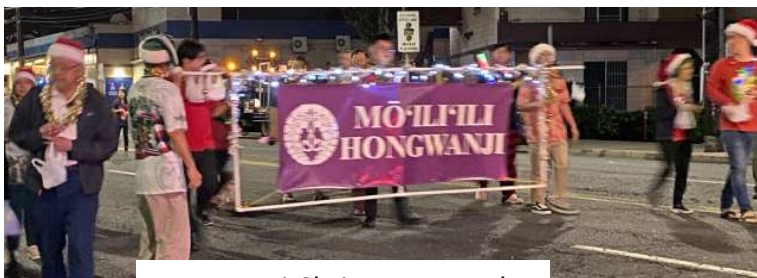
Kapa-Moi Christmas Parade