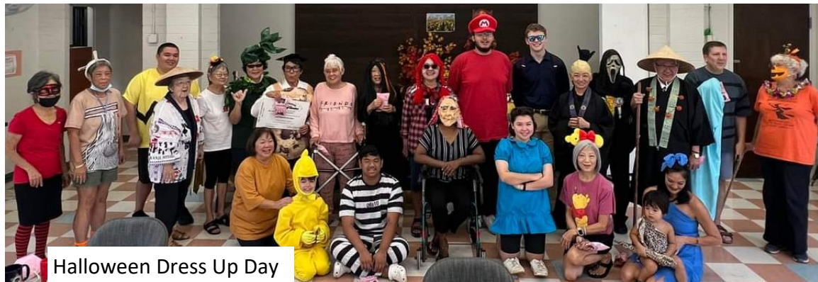
Halloween Dress Up Day