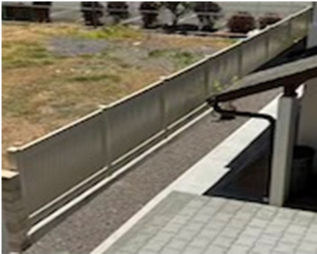
View from above.