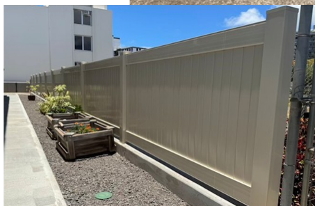
University Ave. side of Annex's extended sidewalk; from makai to mauka view of fence.