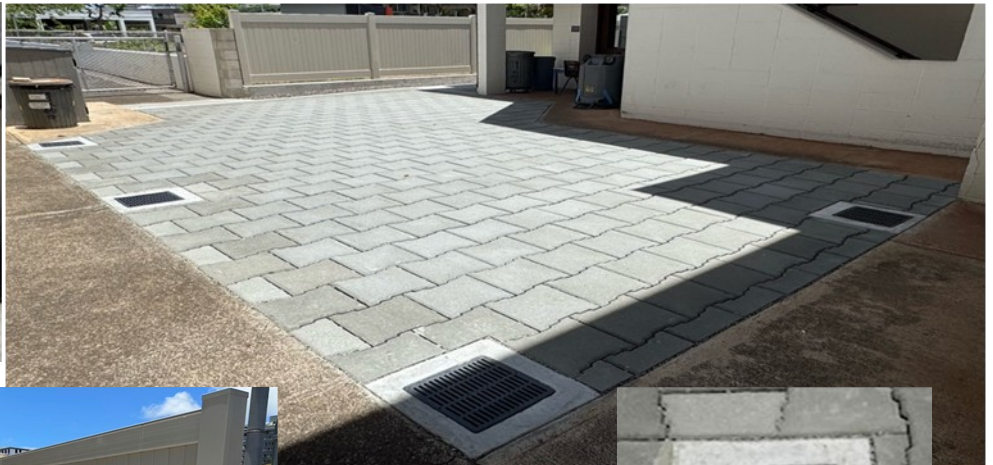
Common area – installed with a courtyard and sidewalk extension pavers and drainage beds.