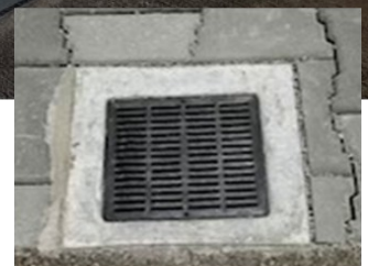
Edges around drainage beds and pavers were adjusted for preventative measure of foot/toe/heel snags.