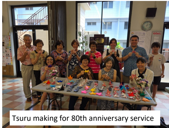
Tsuru making for 80th anniversary service