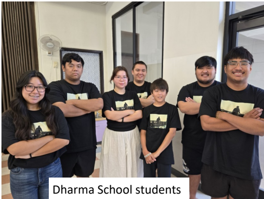
Dharma School students