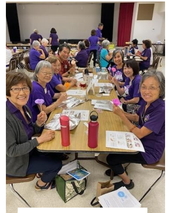
BWA Joint Conference